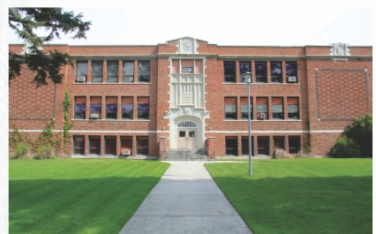
Raffles International School