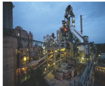
J K Cement

Note: This brochure is only a conceptual presentation and not a legal offering. The promoters reserve the right to alter and make changes in highlights, facilities and other information mentioned in this brochure as deemed fit.